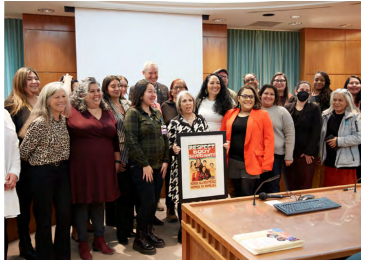
RFDC grantee Bold Futures NM and other members of the Reproductive Healthcare Success Project with Governor Lujan Grisham

In 2022, Bold Futures was also able support legislation, public education, and community organizing around two bills, prohibiting public entities from creating barriers to reproductive health care services for individuals and adding gender affirming care to the definition of reproductive health care, and develop a Reproductive Healthcare Success Guide as a community-led resource for care providers in the state.